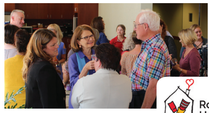
n open house was held on August 30, 2017 to welcome the Ronald McDonald House staff and board members to Bright Kavanagh House.

For three months, Bright Kavanagh House served as a temporary home for the Ronald McDonald House during the construction of their new house in Des Moines. Our facility provided out-of-town parents and family members a place to stay while their seriously ill and injured children receive medical treatment at area hospitals.